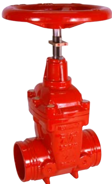
AVK Series 06/37 red valve for sprinkler systems