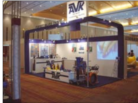
AVK Malaysia made an impressive presence in the Malaysia Water 2007 Exhibition, which was held on 14th – 16th May 2007 in the Kuala Lumpur Convention Centre, Malaysia.

With a consistent aim to comply with current trends and industrial demands, we can explore and develop the potential water treatment market in Malaysia providing excellent opportunities for us in the coming years.