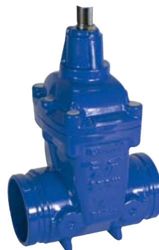
AVK Series 06/38 blue valve for irrigation and HVAC