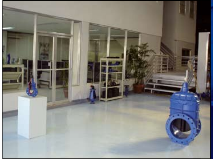
The customer lounge where customers can meet and discuss the advantages of using AVK products in their water supply projects.

With a higher warehouse capacity, AVK Philippines has now complemented its inventory of valves with ductile iron tees, elbows, and adapters necessary for installation of water supply systems. This makes AVK Philippines a one stop shop when it comes to valves and fittings for the numerous water supply projects in the Philippines.